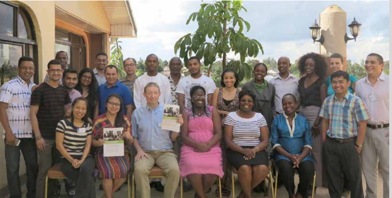
Group Photo Southern Voices planning workshop developing JPA version 2, Nairobi, April 2018